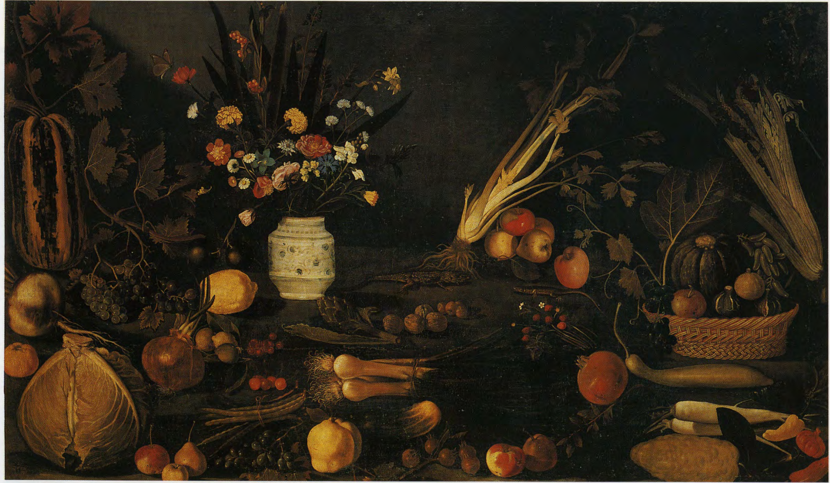
Anonymous, c.1600, Galleria Borghese