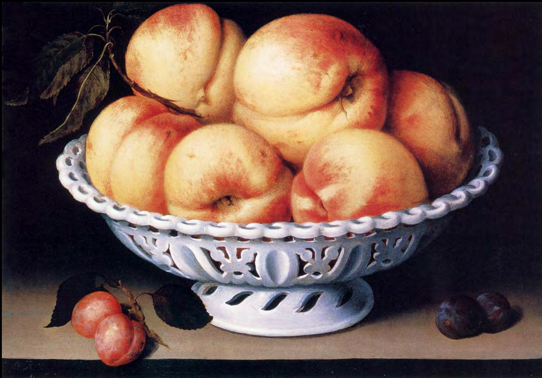
Fede Galizia, c. 1600