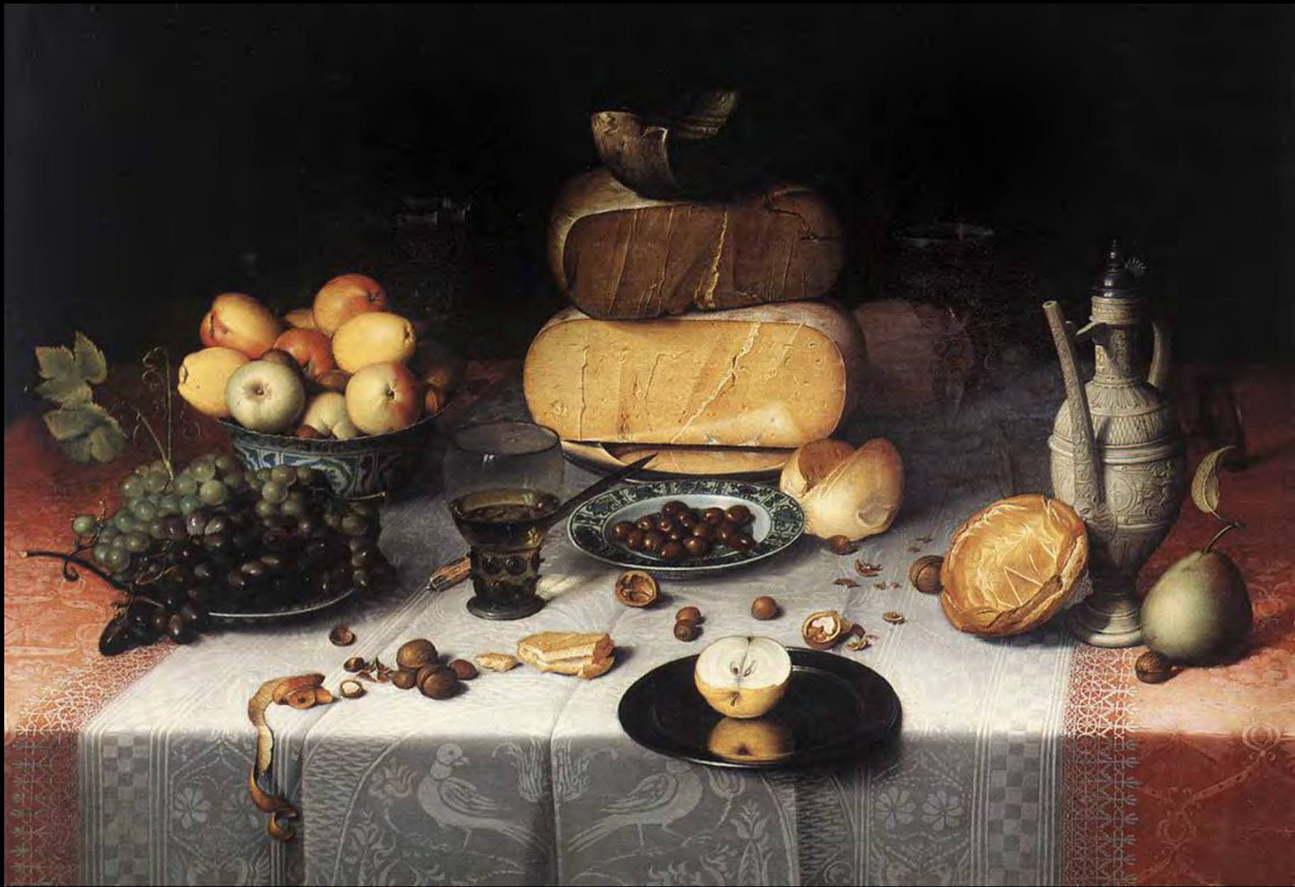
Floris van Dijk, c. 1610