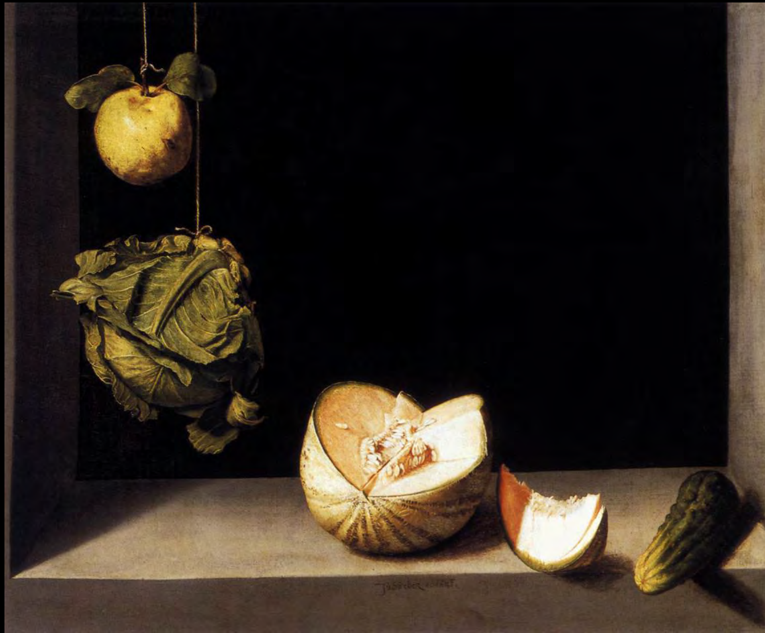
Juan Sánchez Cotán, c. 1600, Museum of Fine Arts, San Diego