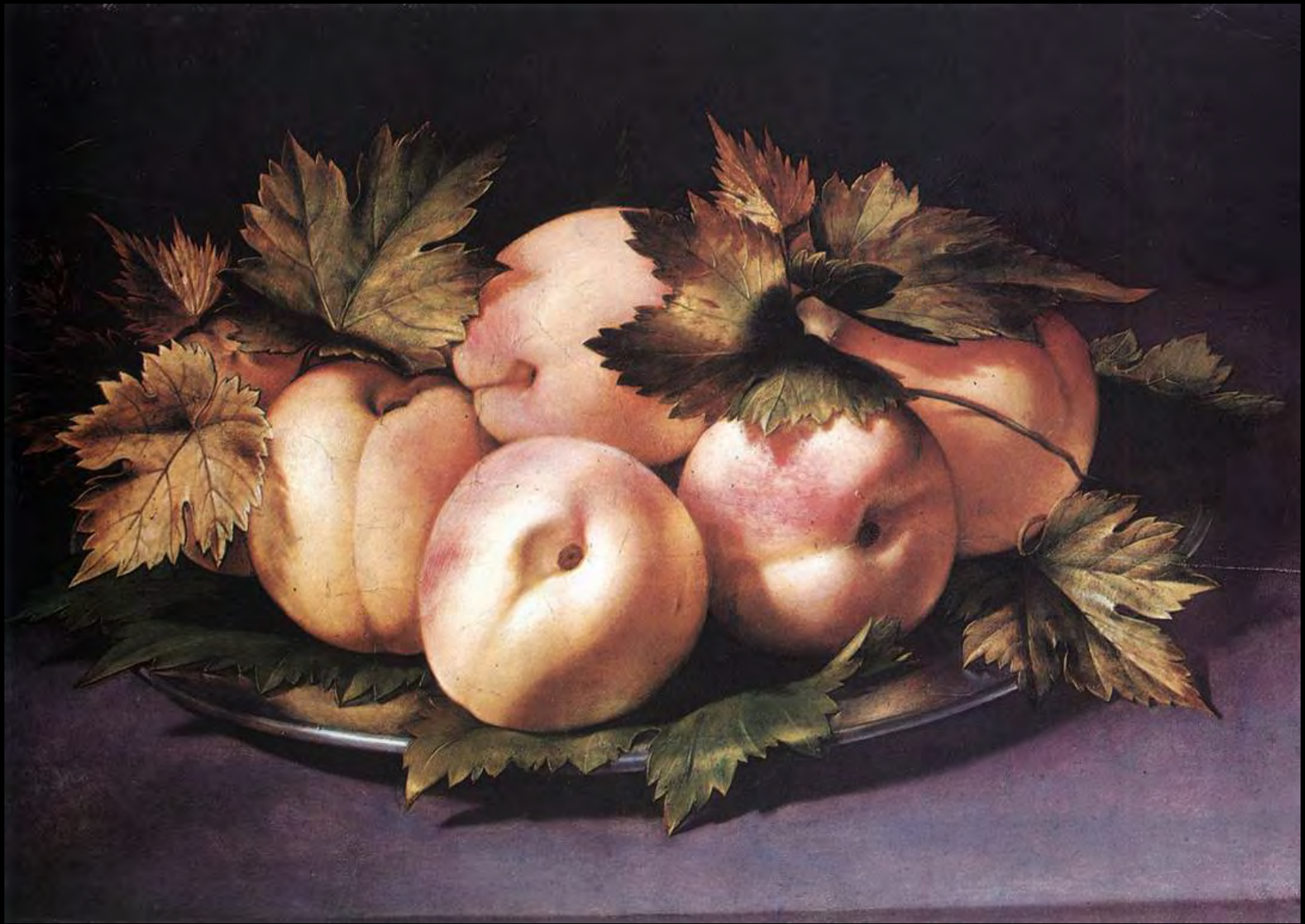
Ambrogio Figino, c- 1590-95