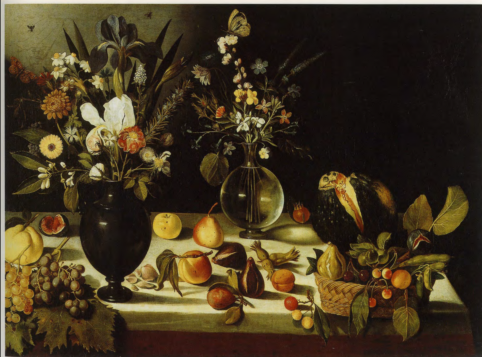
Master of the Hartford Still Life, c. 1600, Wadsworth Atheneum, Hartford