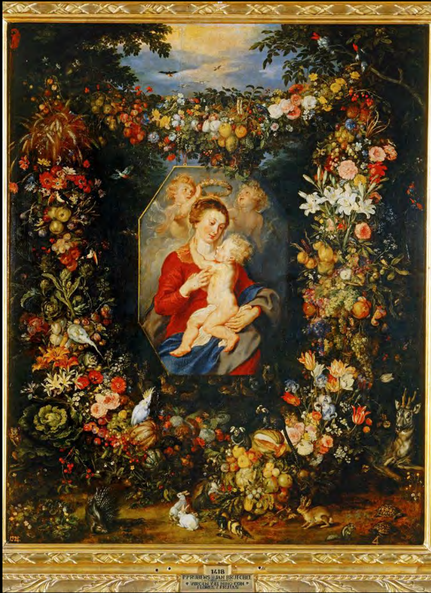
1618 P. PROBENS · JAN BRUEGEL · VIRGIN & EL NIÑO CON · · FLORES · FRUTAS ·