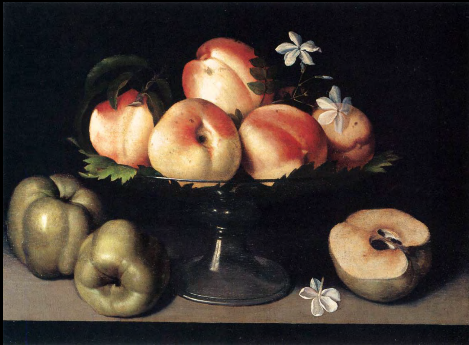
Fede Galizia, c. 1605