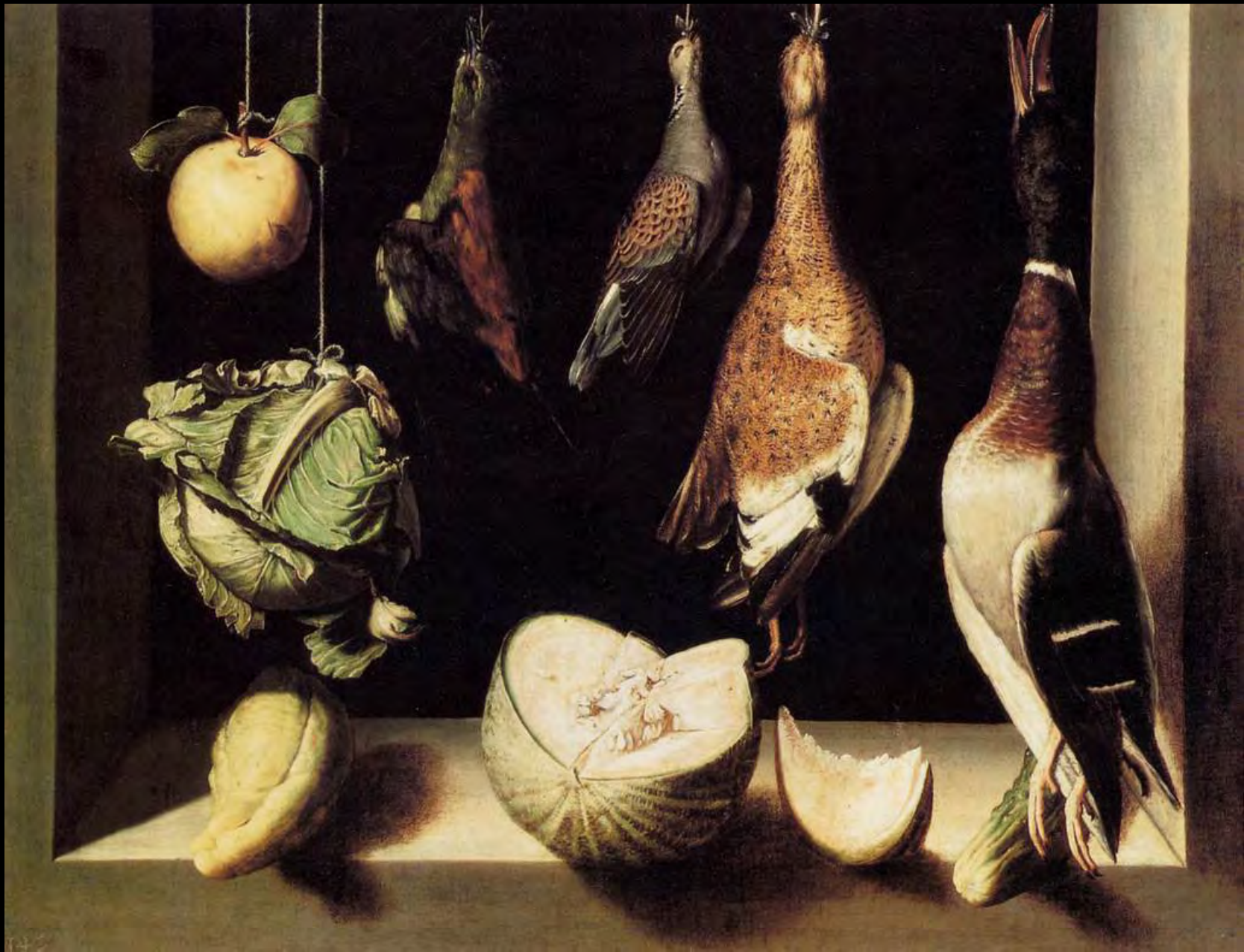
Juan Sánchez Cotán, c. 1600, Chicago Art Institute